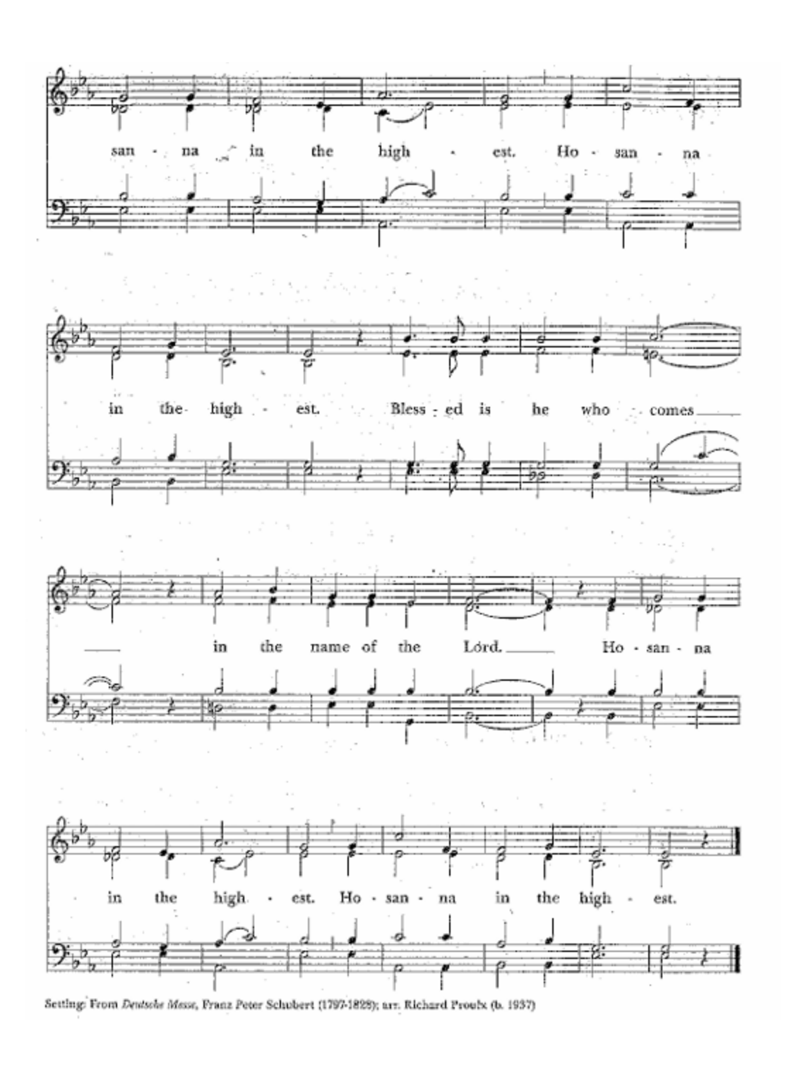
The people may kneel or remain standing.